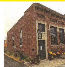
Mary Rose Collection